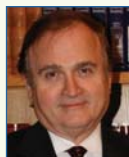
Nicholas A. Peppas

Founder of biomedical engineering. Pioneered use of films and surfaces in biomedical applications — rheological and clotting properties of human blood; polyethylene oxide as biomaterial; molecular transport across membranes; artificial kidneys, blood oxygenation and accompanying CO 2 removal during open heart surgery.