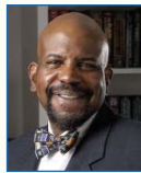
Cato T. Laurencin

Recognized for developing and scaling up new approaches and materials for process chromatography, absorptive bioseparations, and biocatalysis.