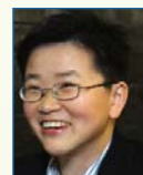
Jackie Y. Ying

Recognized for work on design and yield improvements of recombinant protein production; cell-free methods in developing patient-specific cancer vaccines, having so produced active complex hydrogenases enzymes; improved water filters based on the protein Aquaporin Z's ability to pass only water, possibly leading to highly selective biosensors