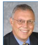
Larry F. Thompson

Recognized for seminal reactive multicomponent mixing research. Toor Test is industry standard for assessing relative mixing and reaction rates.