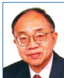
Norman N. Li

sound drug delivery and growing engineered muscle tissue and engineered blood vessels. Youngest person ever elected to all three American National Academies.