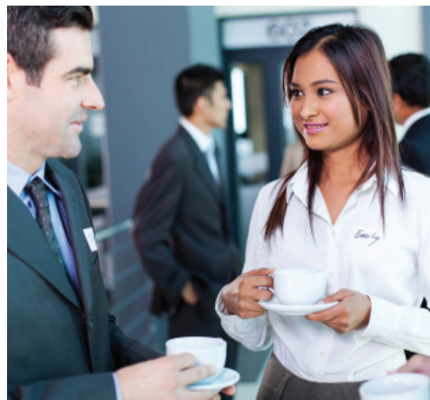
EXHIBIT BOOTH PACKAGE DETAILS INCLUDES