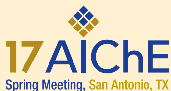
EXHIBIT DATES: MARCH 27 – 29, 2017

Henry B. Gonzalez Convention Center • San Antonio, TX, USA