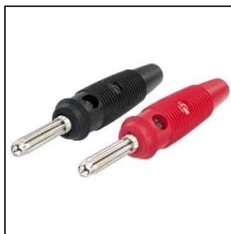
Figure 1: Male banana plugs

Cubes will be supplied with DC current only as to allow for the use of off-grid power sources such as solar or wind power. For safety reasons, cubes may not exceed 10A or 120 watts. Cubes operating at a higher wattage will not pass safety inspection and therefore will not be able to compete. Regulated 12 V DC power will be provided for the competition. Your plant must use exactly 12 V. Power will be provided from standard banana jacks (socket) color coded red and black to indicate polarity. Ensure that your plugs are not “bulging” out and are uniform in size to ensure a proper connection with the power supply. (See image below for reference). Cubes should provide suitably insulated, properly gauged leads not less than 12ft in length terminated in standard banana plugs to access the provided power. During the duels, total power consumption will be measured by each cube and be included in the scoring rubric.