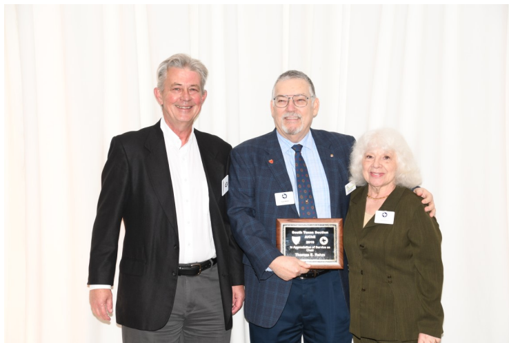
Networking and Family Photos at the January Dinner Meeting!