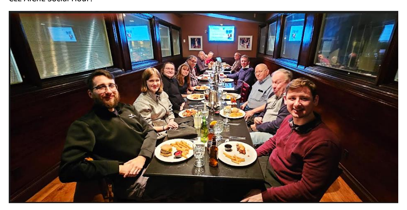
CLE AIChE Dinner.