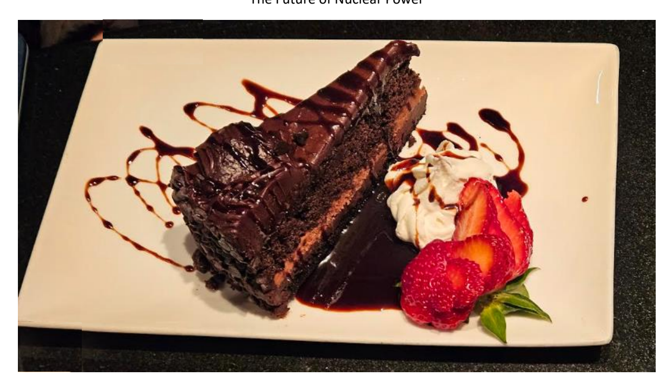
A "Sweet" evening was had by all!