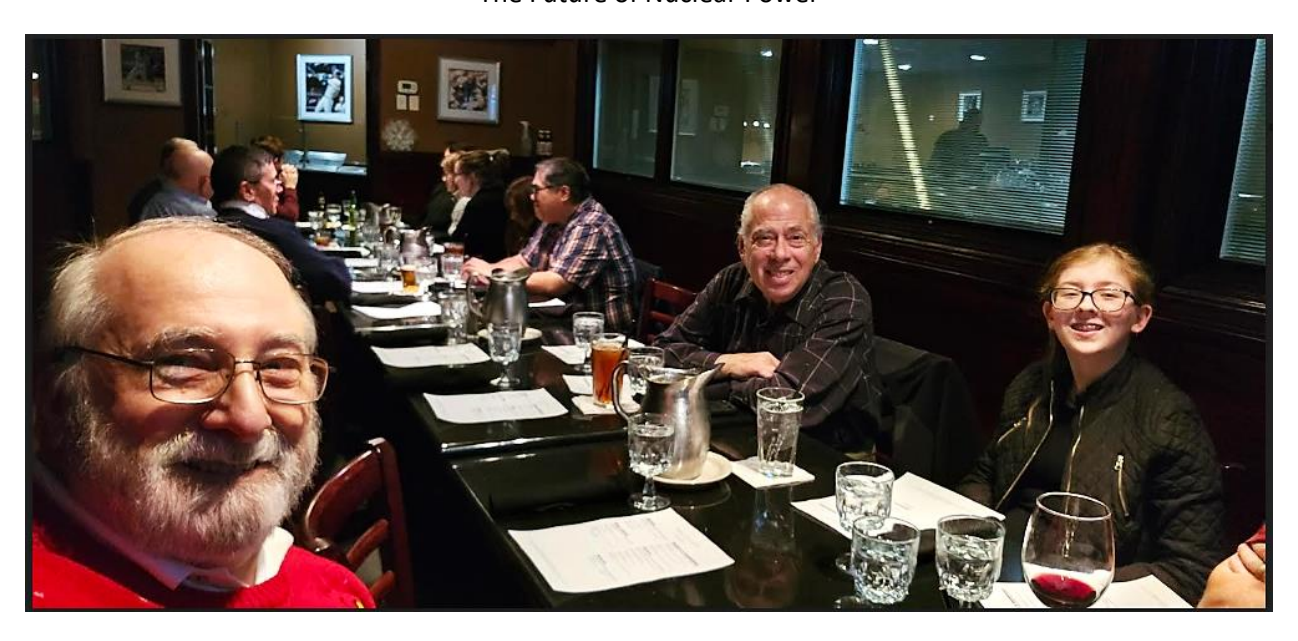
CLE AIChE Social Hour!