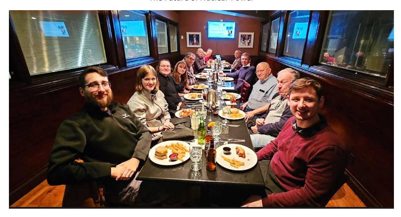
CLE AIChE Dinner.