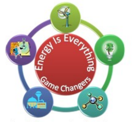
AIChE Midwest Regional Conference UIC- Chicago, IL November 10-11, 2011

Tower - Rm 605 (University of Illinois at Chicago)