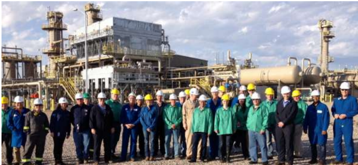
DCP Midstream Tour at our May 2014 Section Meeting