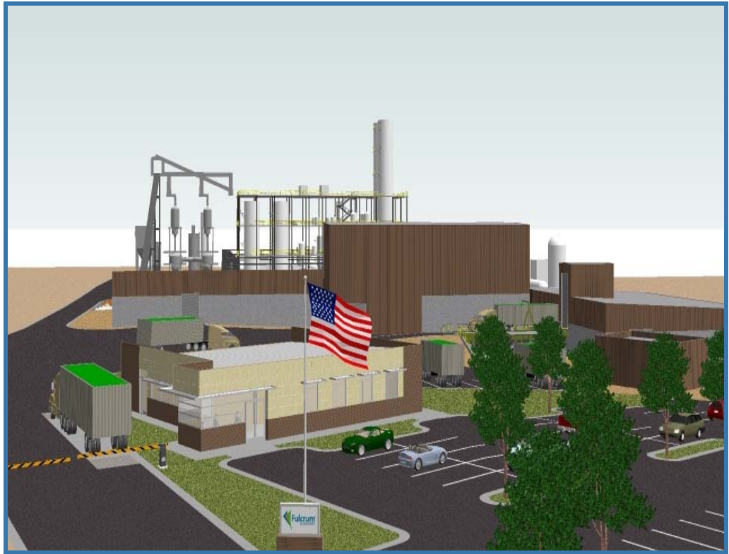
A Rendition of a Fulcrum BioEnergy MSW to Ethanol Plant.