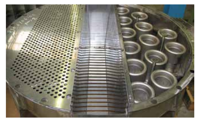
▲ Figure 2. The Shell ConSep tray is a centrifugally aided, high-capacity tray that is used mainly in tower retrofits.

▲ Figure 1. Electrolyte modeling tools can be combined with process simulators to predict fouling and corrosion conditions in crude distillation towers. The photo shows a distillation valve tray with severe scaling and fouling.