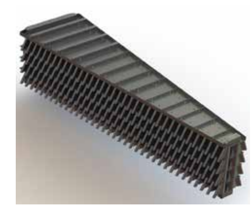
Figure 4. Schoepentoeter-Plus is an advanced centrifugal device for deentrainment and vapor distribution commonly used for two-phase feeds into distillation columns.

These improvements have been rightly focused on addressing the larger resistances to heat transfer in boiling or condensing units (Figure 7). Since heat-transfer rates in boiling/condensing regimes are much higher, the improvements generally address the convective side of the heattransfer process.