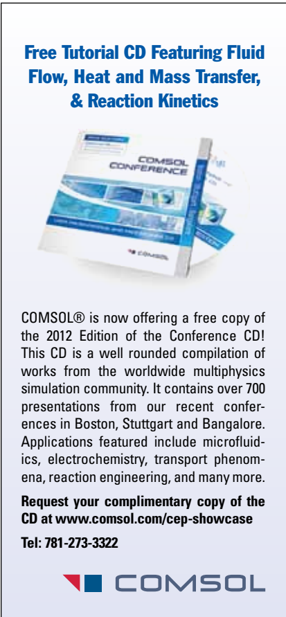
www.aiche.org/cep or Circle No. 153 on p.63