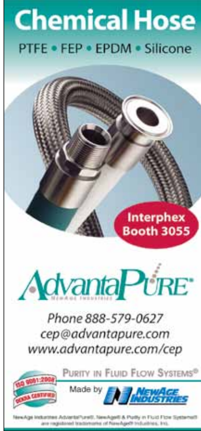
www.aiche.org/cep or Circle No. 151 on p.63