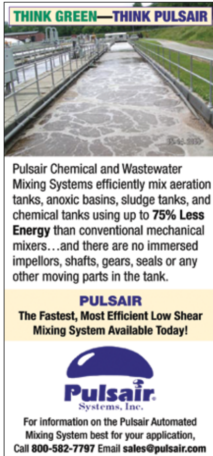
www.aiche.org/cep or Circle No. 154 on p.63