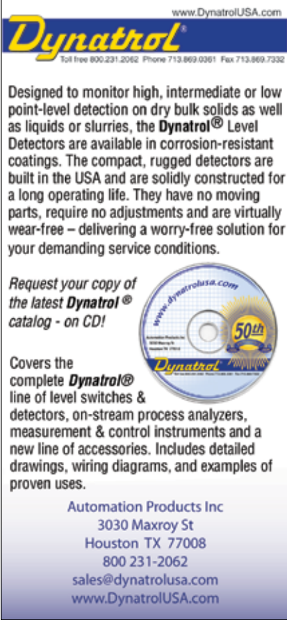
www.aiche.org/cep or Circle No. 150 on p.63