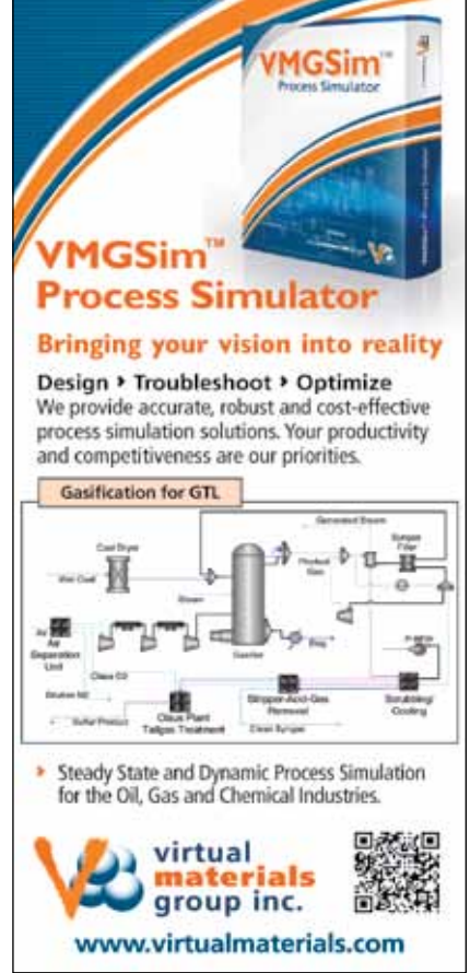
www.aiche.org/cep or Circle No. 152 on p.63