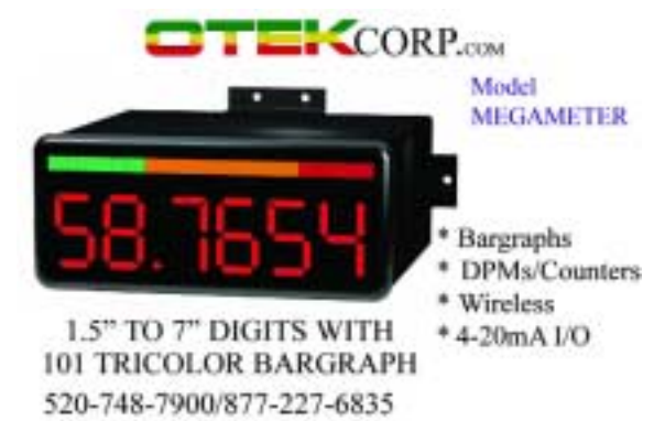
Reader Service Number # 150