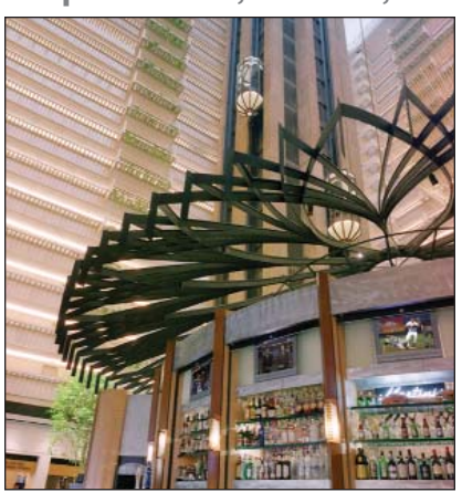
Exterior (left) and interior (above) views of Hyatt Regency in Atlanta, site of the AIChE 2005 Spring Meeting and Global Congress on Process Safety.

The AIChE 2005 Spring National Meeting & Global Congress on Process Safety will be held in Atlanta at the Hyatt