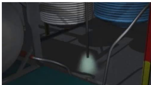
Figure 2. Process vapors released at a low level near the process area

On April 12, 2004, a company in Dalton Georgia, USA was contracted to make triallyl cyanurate. A runaway reaction occurred, and flammable and toxic allyl alcohol and allyl chloride were released to the atmosphere. Some material was released through a poorly sealed manway (Figure 1) and more through the rupture disc vent which discharged near the base of the reactor (Figure 2). The release forced the evacuation of over 200 families in the surrounding community.