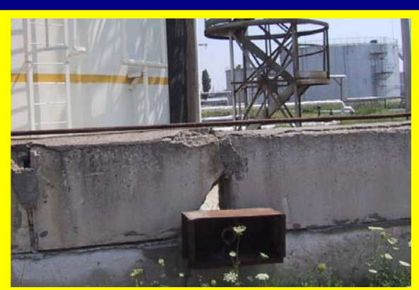
June – a hole in the wall of a tank farm containment dike

Can you figure out what the April, May, and June 2010 issues of the Process Safety Beacon have in common? All of them discuss a type of safety equipment that can generally be described as passive . Passive safety devices do not have to detect an unsafe condition or take any action to perform their protective safety function. They have no sensors or moving parts. They do their job because of their construction – for example, the insulating characteristics and thickness of insulation or fireproofing, or the height and impervious material of construction of a dike wall.