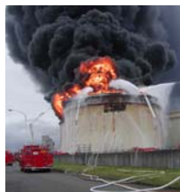
Fire after an earthquake in Turkey in 1999 →