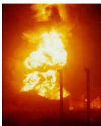
← Aftermath of an earthquake in Japan in 2003