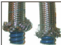
Hastelloy (left) and stainless steel hoses appear identical.