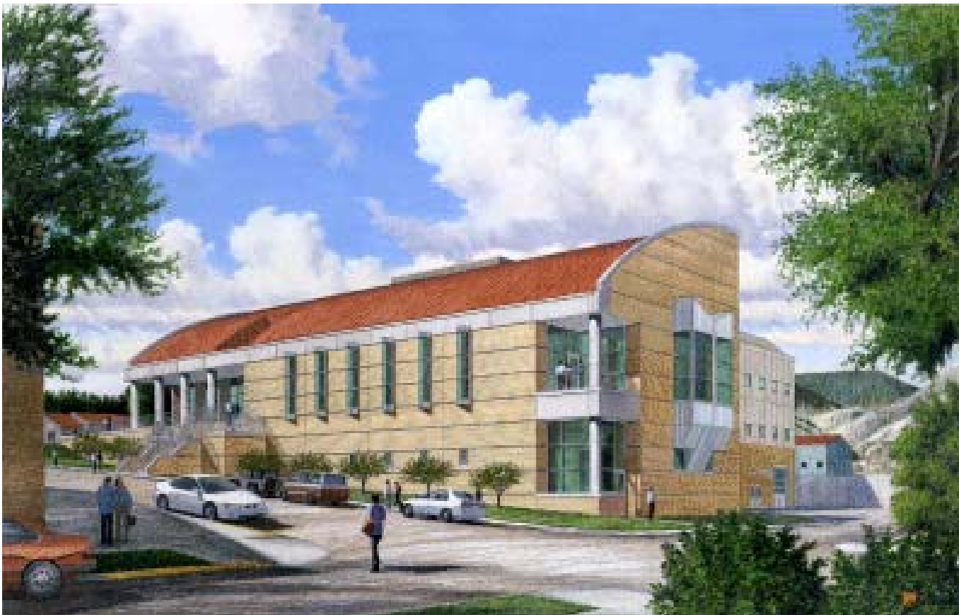
Photo of the east face of the Colorado School of Mines Geology Museum