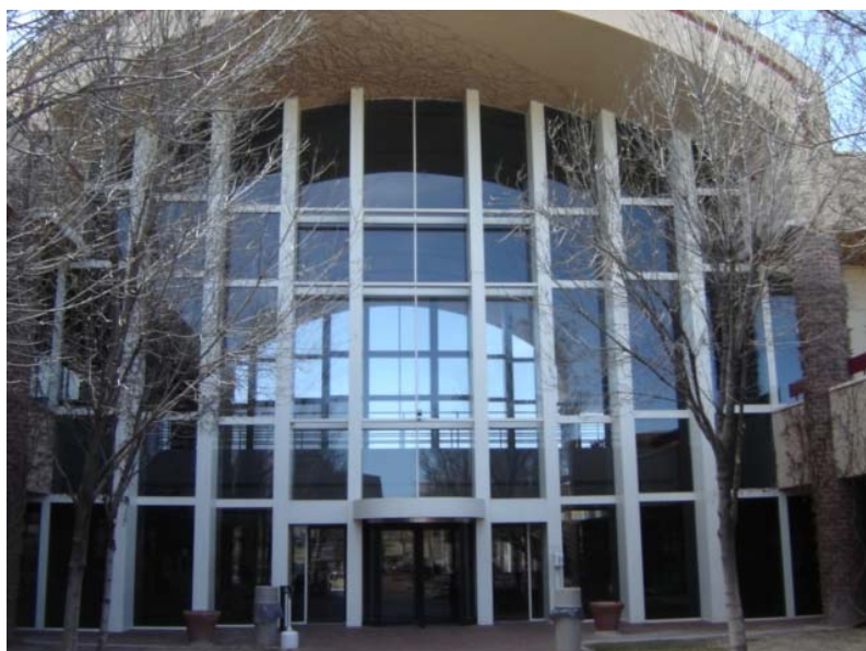
Entrance to the Albuquerque Journal headquarters