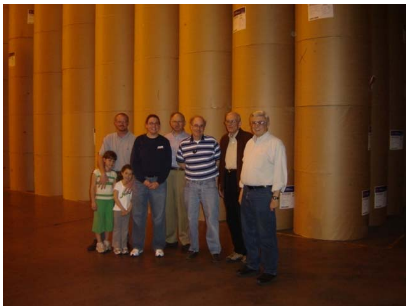
AIChE – New Mexico Group - our tour group in front of the big rolls of paper (2200 lbs each!!! - wow!)