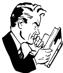
Quote of the Month

WE'RE ON THE WEB! WWW.TULANE.EDU/ ~BMITCHE/AICHE/ AICHE.HTML