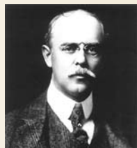
Arthur D. Little