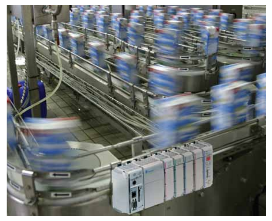
▲ Figure 1. Advanced automation and control is at the heart of smart manufacturing. This multipurpose system synchronizes and monitors processes in a bottling plant.

The goal of the smart manufacturing movement is to create knowledge-embedded manufacturing operations. Today's operations will be transformed from reactive to proactive, response to prevention, compli-