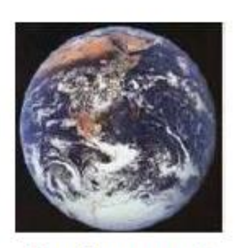
Environment & Sustainability