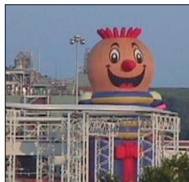
April Emergency Response