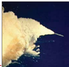
June Safety Culture