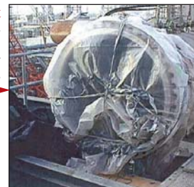
August Temporary Confined Spaces