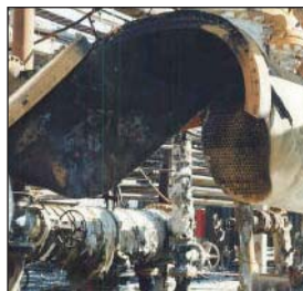
November Cold Embrittlement