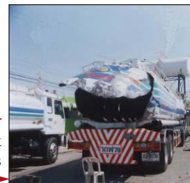
September Hot Work Permits