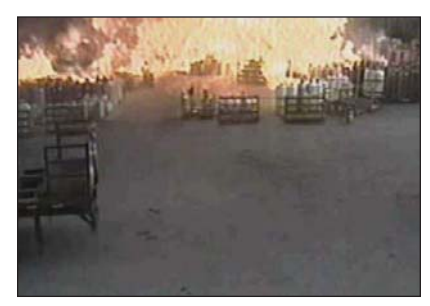
October - Gas cylinder storage explosion