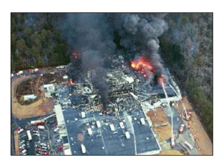
May — Dust explosions