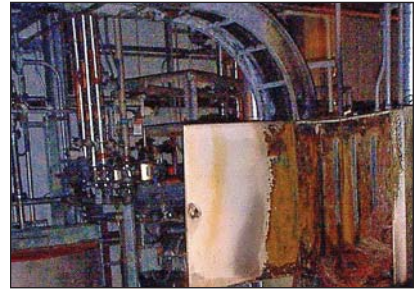
July — Incompatible chemicals